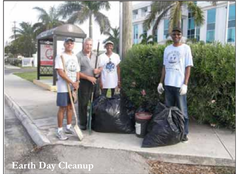
Earth Day Cleanup